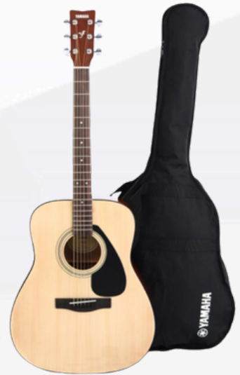
YAMAHA GIG MAKER 310