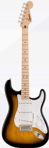
FENDER STRAT SQUIER